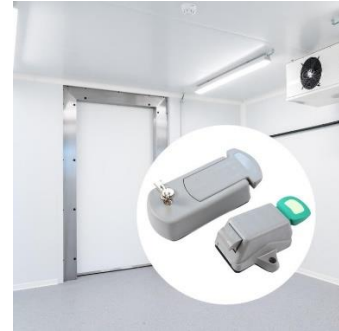
Coldroom door lock with safety release