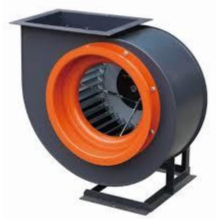
Centrifugal blower fan (industrial Process Fan)