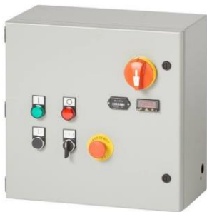
Coldroom control panel