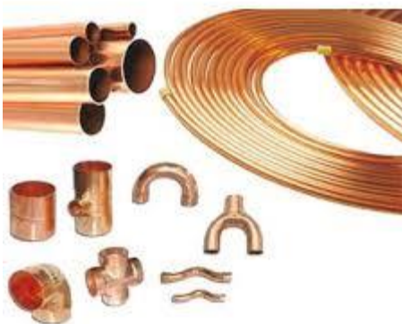
Refrigeration copper tubes and copper fittings