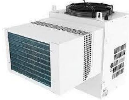
2hp monoblock refrigeration unit