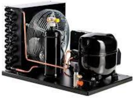
Embraco condensing unit