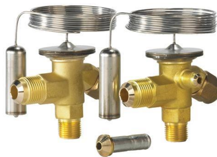
Thermostatic expansion valves with interchangeable orifice