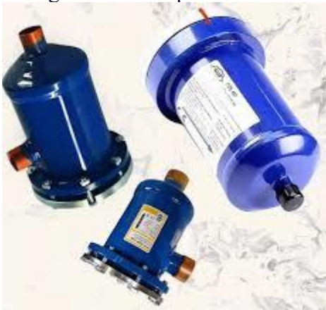
Refrigeration oil separator