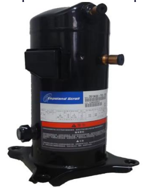
Copeland scroll compressor