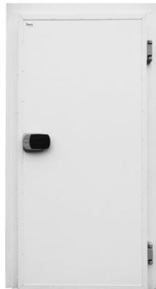
Cold room hinged door