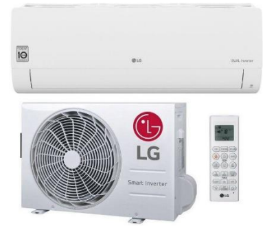
LG Split High wall air con