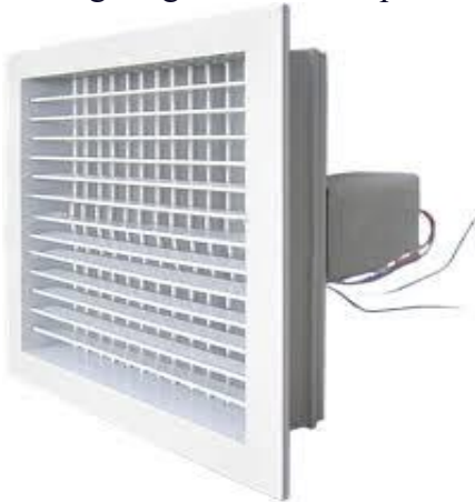
Ceiling air grille with damper