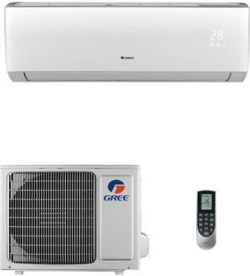
Gree air conditioners