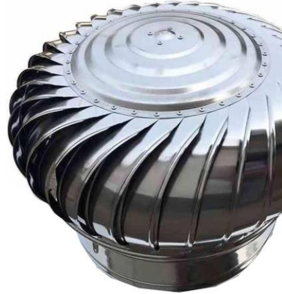
Wind driven roof ventilators|ventilators|unpc ventilators| cyclone