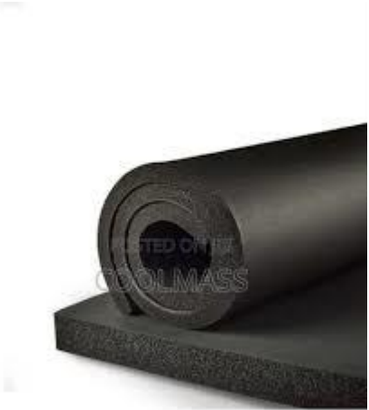
Amrflex insulation sheet