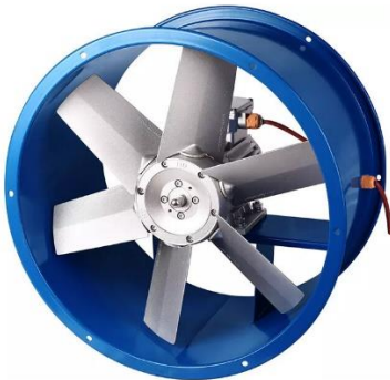
Industrial axial flow ventilation fan