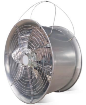
Industrial air circulator