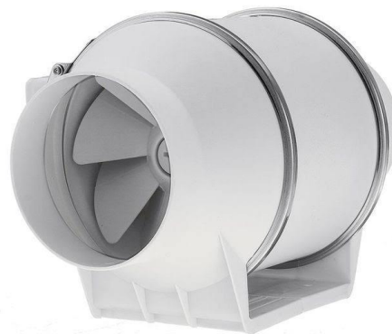
Silent inline duct fan