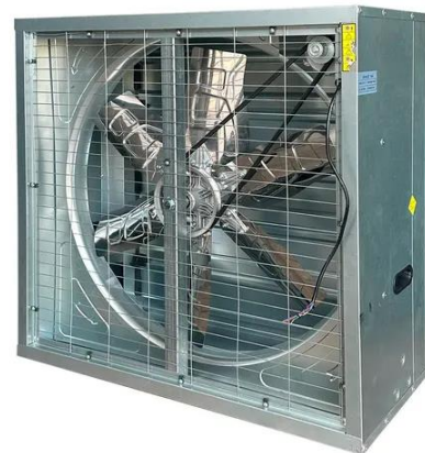
Industrial extractor fan