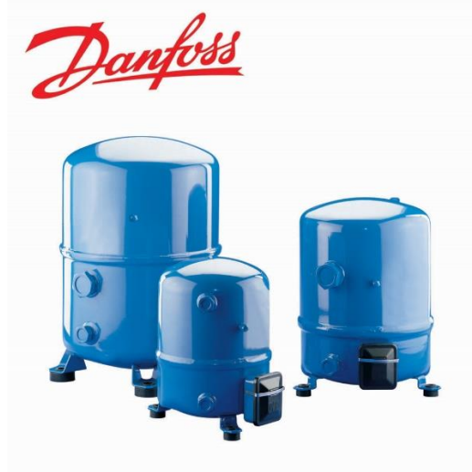
Danfoss manuop compressor