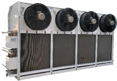
Blast freezer and chiller