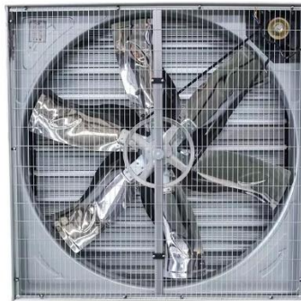
Industrial box fan