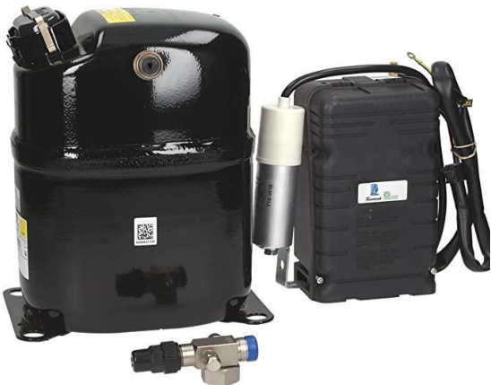
Valve Tecumseh Compressor R404A