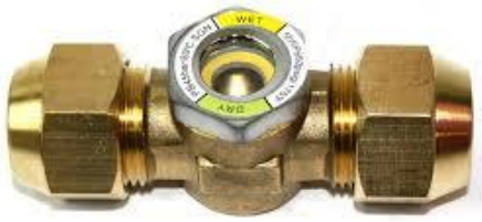
Moisture indicator (sight glass)