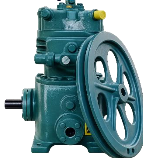
bitzer compressor mk3 flywheel