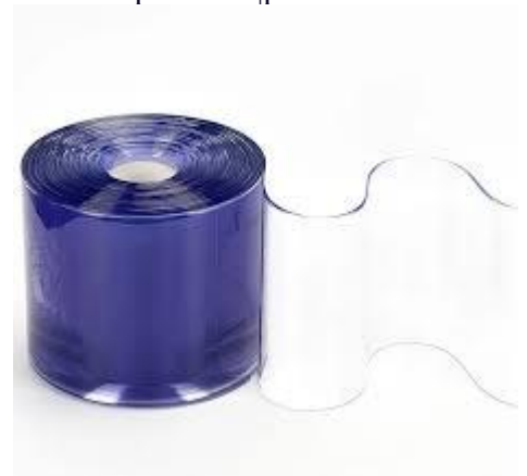
PVC strip curtain|plastic air curtain