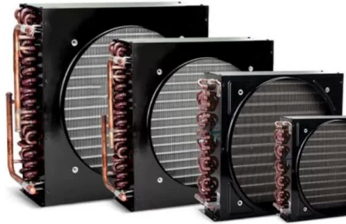
Commercial refrigeration condensers