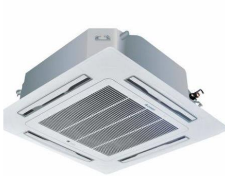
LG ceiling cassette