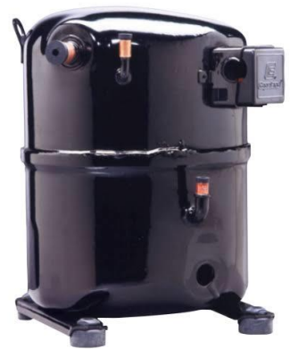
Hermetic refrigeration comp.