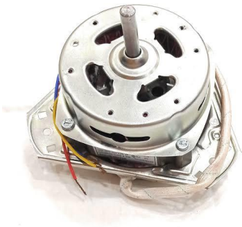
Washing machine spin motor