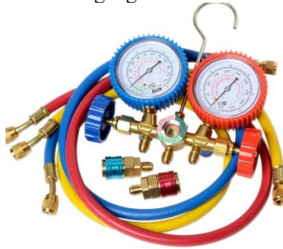
Manifold gauge set