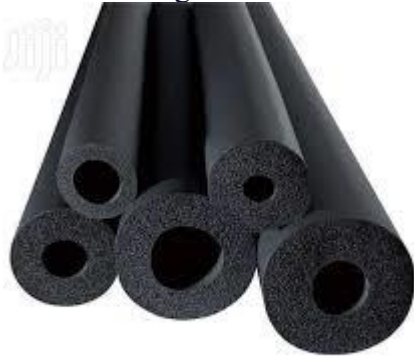
Amoflex tubing insulation