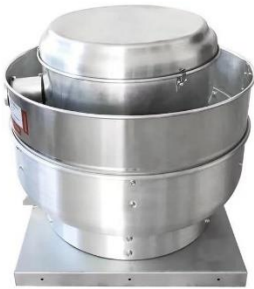
Upblast roof fan