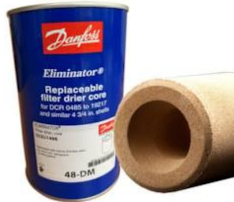
Filter drier core