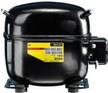
Danfoss secop refrigeration compressor