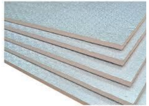
PIR panel sheet (pal sheet)