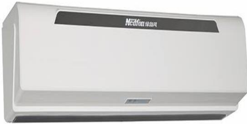
Nedfon air curtain