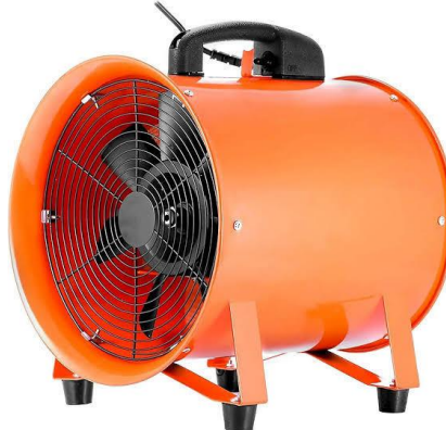
Portable ventilation fan 300mm(12 inch) with flexible duct