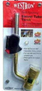
Map gas torch