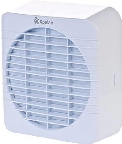
Xpelair window fan high performance extractor fan