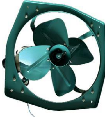
Heat extractor fan