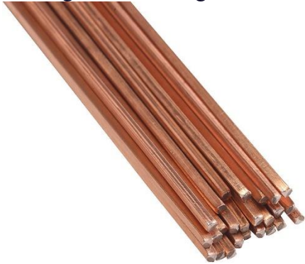
Brazing rods for refrigeration