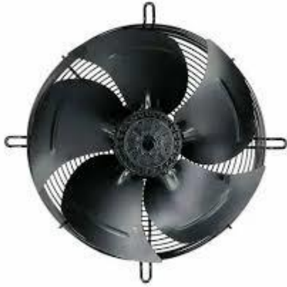
Coldroom condenser fan