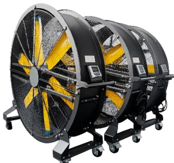
Portable industrial fan with smart control system