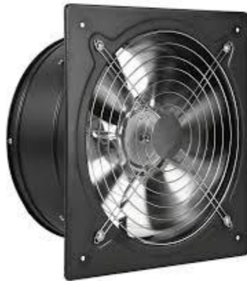
Wall mounted Kitchen and container ventilation fan for heat and smoke extraction