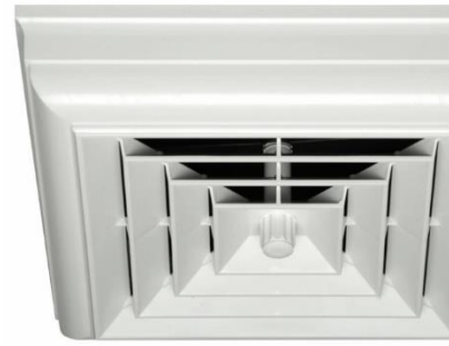
Ceiling diffuser with dump