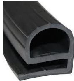
Cold room door rubber gasket